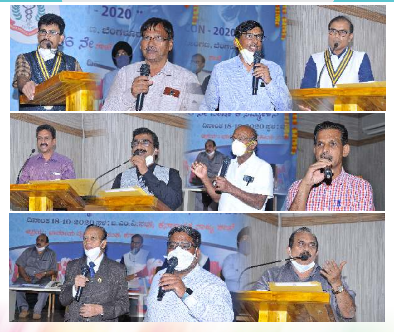
86th Medicon 2020 - Inauguration